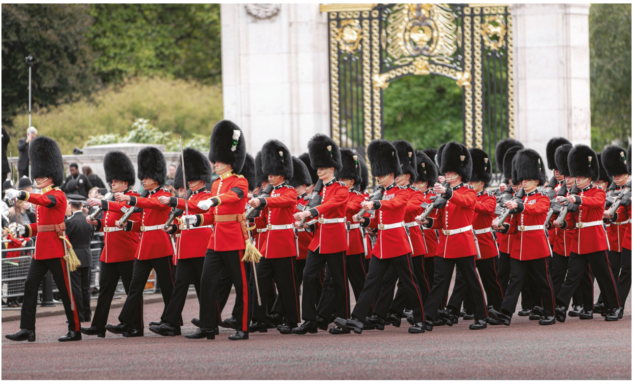
Welsh Guards Half-Companies marching onto the Mall