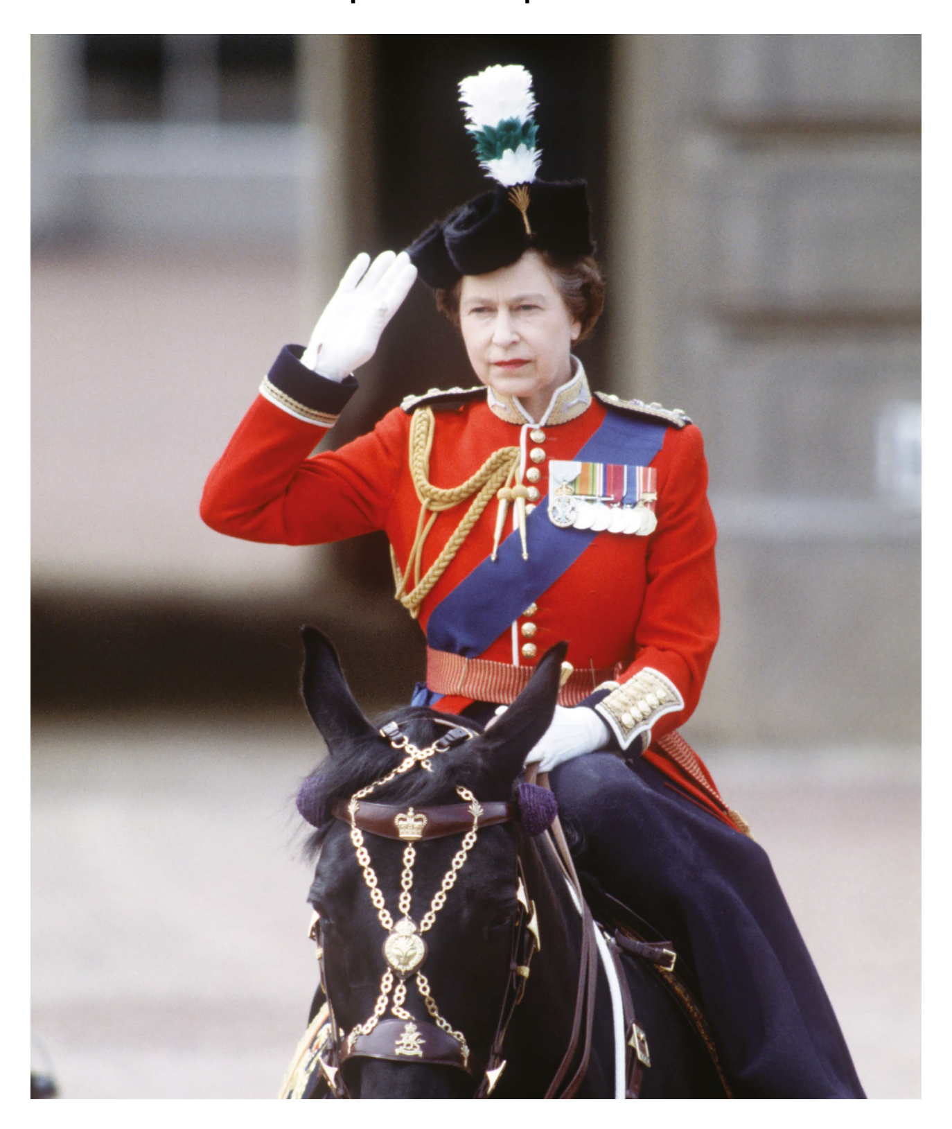
Colonel-in-Chief Welsh Guards 6th February 1952 – 8th September 2022