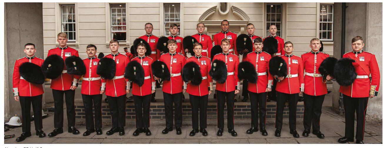
Number 33 Half Company

especially when it came to getting through innumerable police blockades and road closures. So large was the burden that trains were commandeered as troop trains to bring personnel from the concentration areas into London. For the Welsh Guards, who had returned to Windsor, we were moved to Wellington Barracks by coach, but had to depart inordinately early, only to be held at Heston services before being called forward. On arrival we were treated to an exceptional breakfast, an enormous field kitchen had been setup in the basement of Wellington barracks